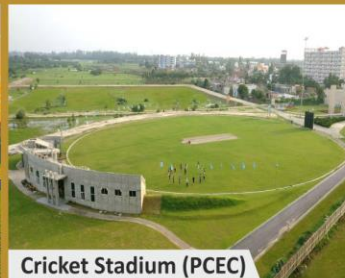
Cricket Stadium (PCEC)