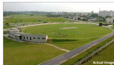
Cricket Stadium (PCEC)