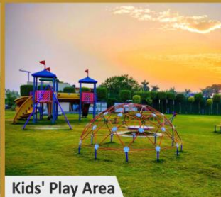
Kids' Play Area